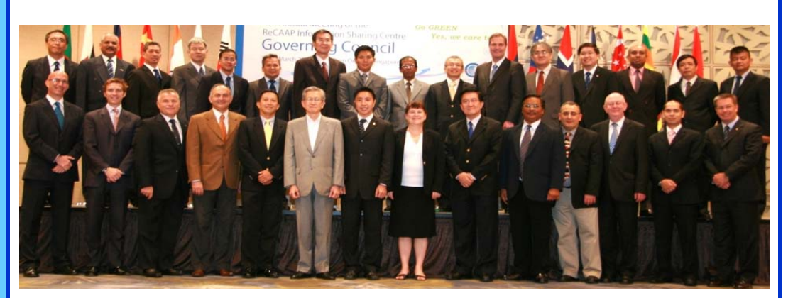
The 4th Annual Meeting of the ReCAAP ISC Governing Council 9-11 March 2010, Mandarin Orchard Hotel, Singapore