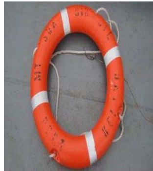
Life buoy of Sun Birdie with the two men