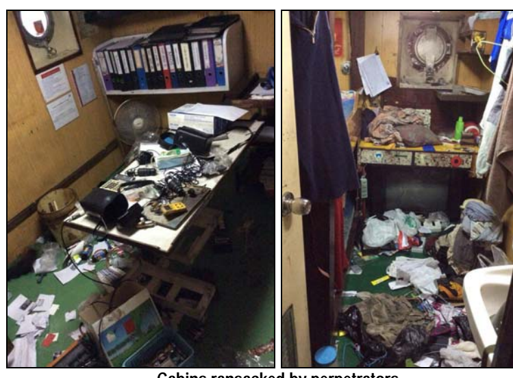
Cabins ransacked by perpetrators