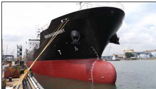
Orkim Harmony

1. The ReCAAP ISC received information that the shipping company of Malaysia-registered product tanker, Orkim Harmony had reported loss of communications with the vessel. The company had been receiving the vessel's hourly position update until 11 Jun 15 at about 2054 hrs. Subsequently, attempts to contact the vessel on all available communications were not successful. The ship's last known position was at 02° 08.90' N 104° 27.30' E (17 nm southwest of Pulau Aur, Malaysia).