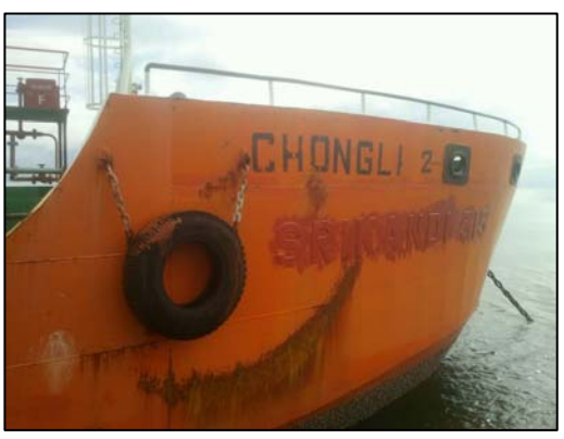
Renaming of "Srikandi 515" to "Chong Li 2"

5. On 27 Nov 14 at or about 1030 hrs (local time), the RTN reported to the ReCAAP ISC that Srikandi 515 has been identified and located at approximately 9 nm off Narathiwat province, Thailand by the RTN and Thai Marine Police. The Thai authorities also apprehended eight perpetrators onboard Srikandi 515 . Srikandi 515 was also reportedly repainted and renamed from " Srikandi 515 " to " Chong Li 2 ". The palm oil cargo onboard the vessel was apparently left intact. The vessel was subsequently escorted back to Songkhla, Thailand for further investigation.