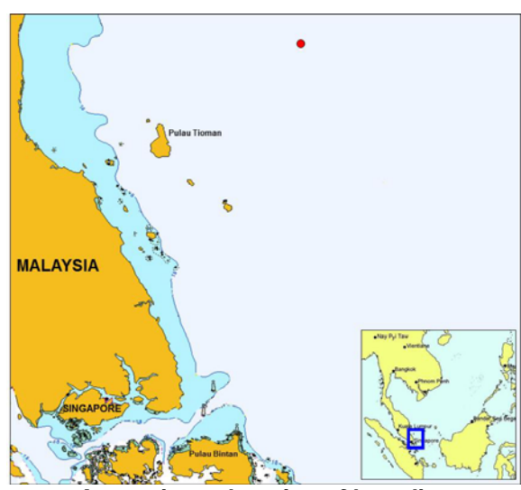
Approximate location of boarding