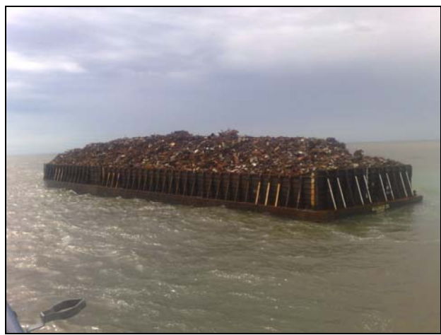
Missing Tug Boat Woodman 38 (left) & Barge Woodman 39 (right)