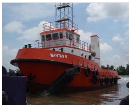
Tug boat, Wantas 6

The ReCAAP ISC requests all vessels transiting the area to keep a sharp lookout for Wantas 6 (photographs enclosed below for reference) and to report sightings of the vessel to the nearest coastal State. The tug boat, Wantas 6 originally painted red could be repainted and renamed; and possibly intended to be sold.