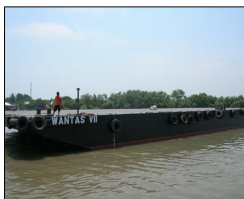
Photographs courtesy of the shipowner Barge, Wantas VII