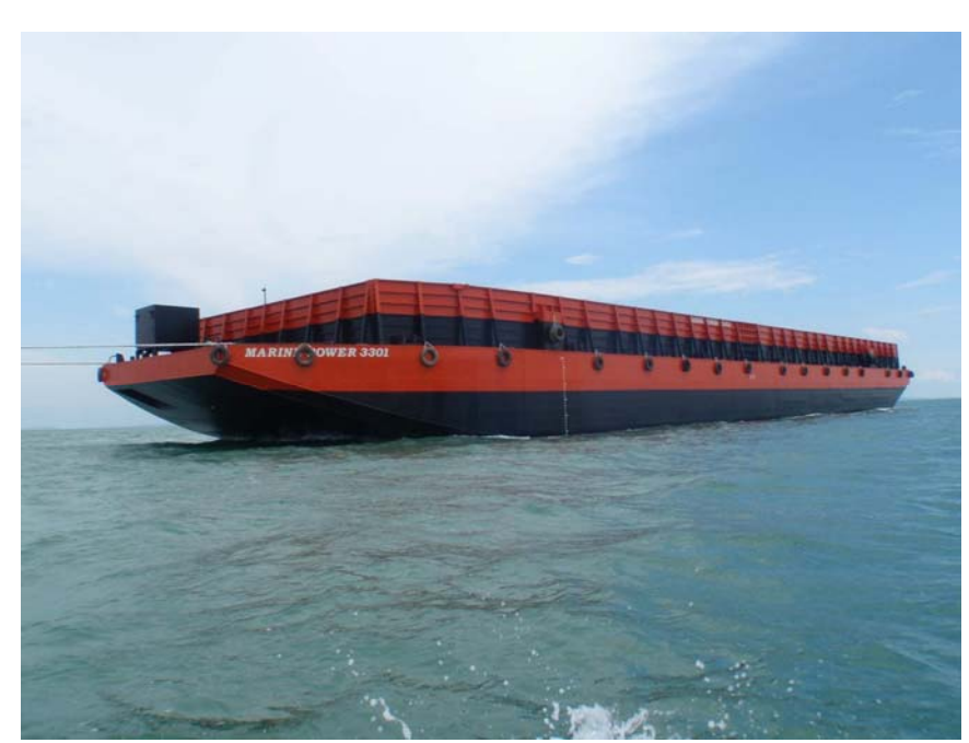
Barge Marine Power 3301