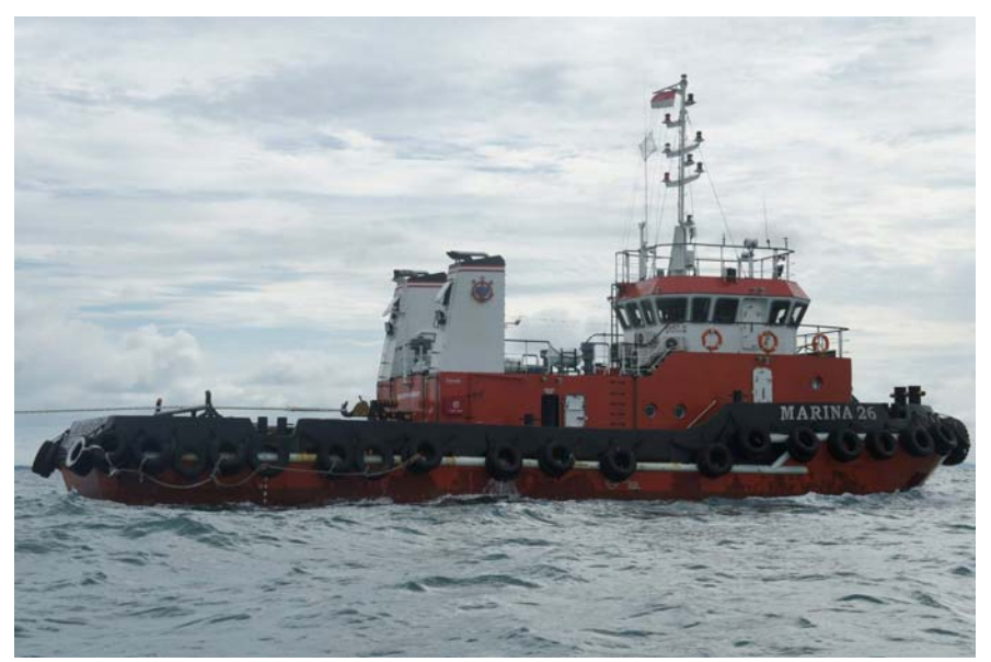
Tug boat Marina 26

The ReCAAP ISC encourages all ships to look out for tugboat Marina 26 and barge Marine Power 3301 and report sightings to Singapore's POCC, or the nearest MRCC. Please refer to pictures of the vessels below.