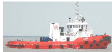
Photograph of Asta

Incident Report: 02/2010 Date/Time of Incident: 06 February 2010 at 0130 hrs (local time) Location of incident: 02° 59.40' N, 104° 00.06' E Area Description: Off Pulau Tioman, Malaysia Name and Type of Ship: Asta /Tug boat (IMO Number: 0095229)