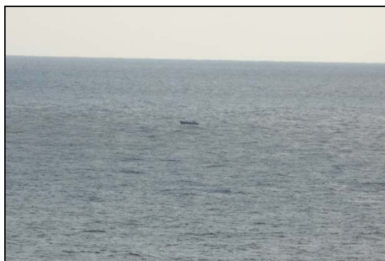
Pirate Skiff 2