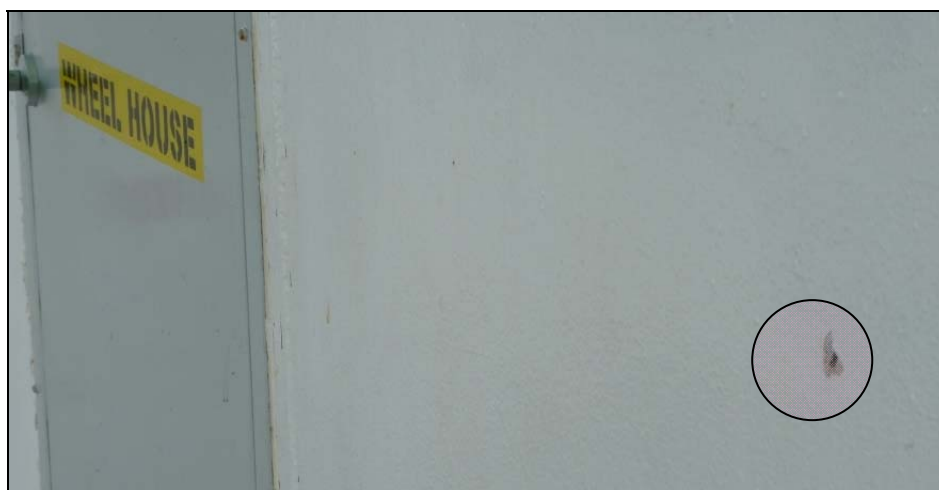
Bullet Scars on the Hull of Tanker