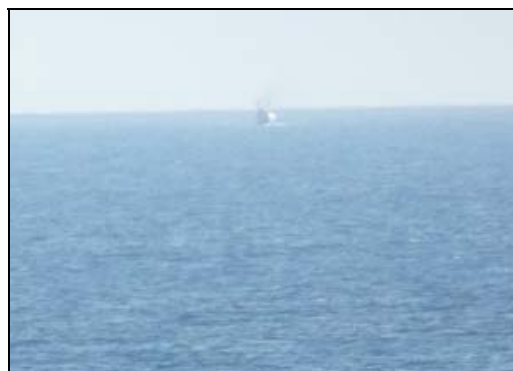
Pirates' Mother Vessel