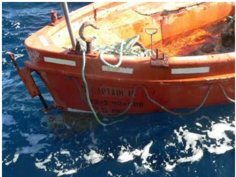
Photographs with courtesy of Japan Coast Guard